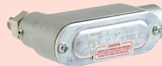
Conduit Housing (-CH)

*Please see our website for dimensional drawings.